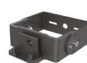
YK - YOKE