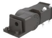
SF - SLIPFITTER