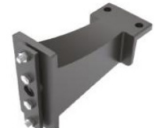
SP - SQUARE POLE MOUNT